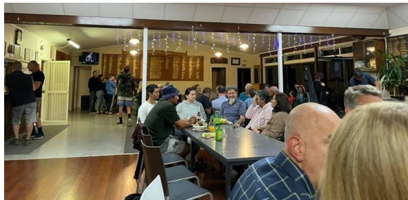
It's all happening at the bowler!

Serving nachos, a variety of toasties and a vege stack everyone in my family was happily catered for. Oh, and did I mention the cheapest beer and wine I've ever seen? The place was packed by 6pm and I got to meet loads of people I had only seen in passing at school drop offs.