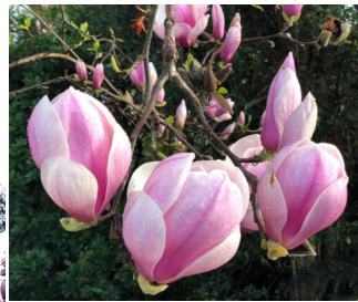
The first signs of Spring appear in Waiatarua. A spectacular local magnolia in full bloom (left and above) and below, daffodils and spring snowflakes in the editor's garden.