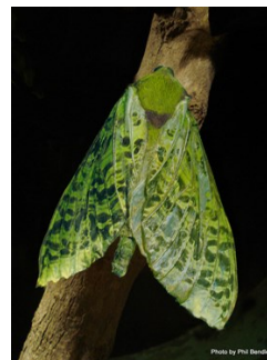
Left: Puriri Moth