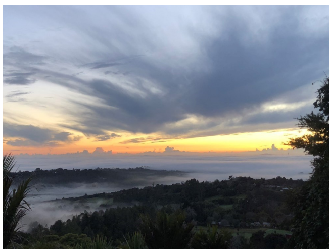
Misty morning view over Waiatarua.