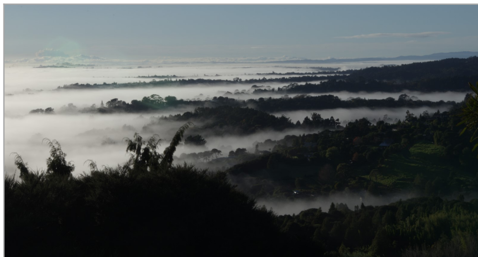
Auckland from Waiatarua, 8:50 am.

Bake in the centre of the oven for 30 mins or until the mixture is crusty on the surface and lightly cooked inside. Do not allow to overcook, as the cake will become spongy rather than gooey in the centre. Serve warm with cream or ice cream.