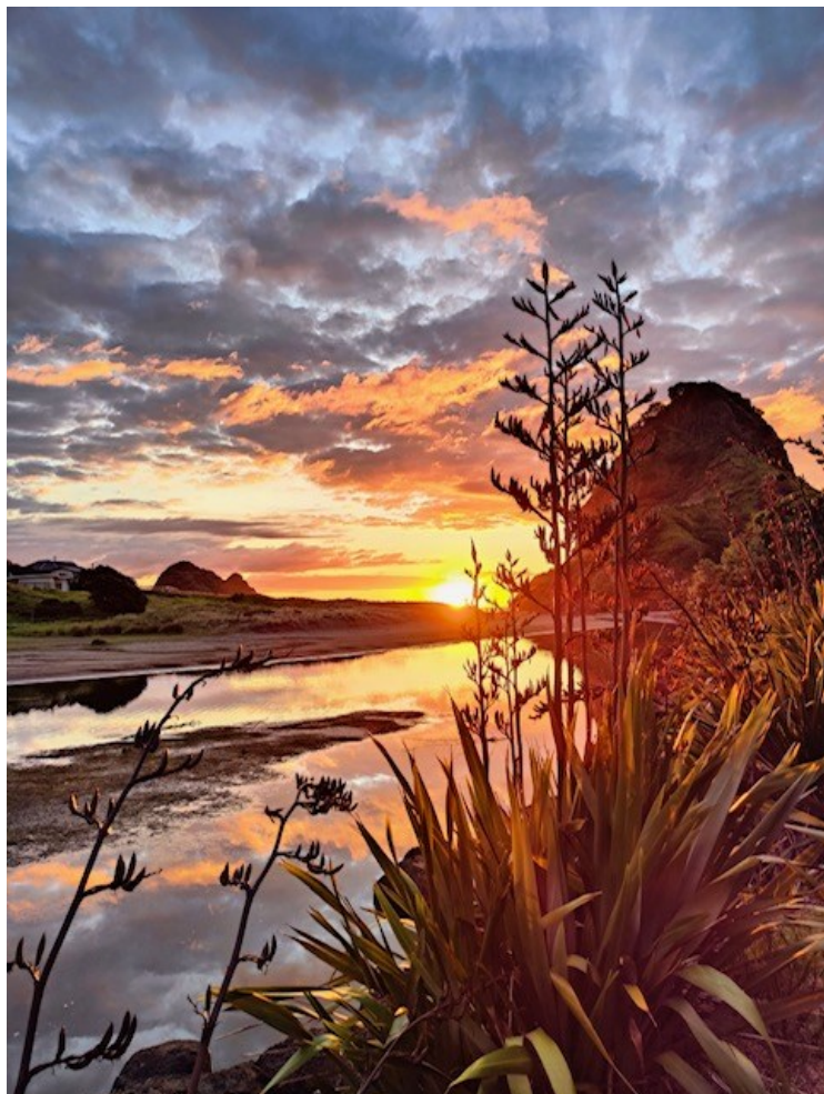
Phillipa Beattie Winner - Water Category