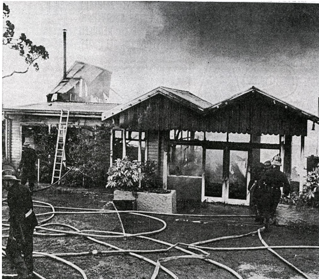
Right: The burned out shell of the Dutch Kiwi the day after the fire.