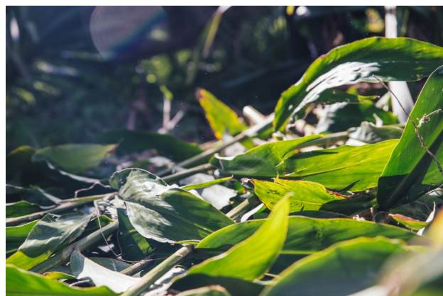
Right: Green stems and leaves from wild ginger can be left in the bush