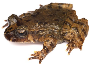
Photo: Hochstetter's frog