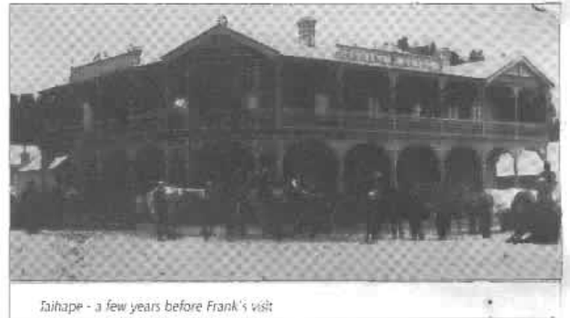
Taihape - a few years before Frank's visit

The last two weary miles were dark, and the road surface less than smooth but yes, Taihape is ahead, the Gretna Hotel still lit up at 10.20p.m. I made myself known to the night porter and find my room. Not the classy standard of the Wairakei hotel but any bed was welcome. The bathroom has a shower only but that was just fine and I soon find myself in the silence of my room. SILENCE? I had not realised that Taihape was a busy rail junction and shunting was to give a sound backdrop to a good night's sleep despite the efforts of the train crews.