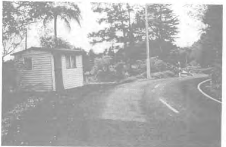
Rumour has it, the new Waiatarua Fire Station is on it's way - as seen in Forest Hill Road