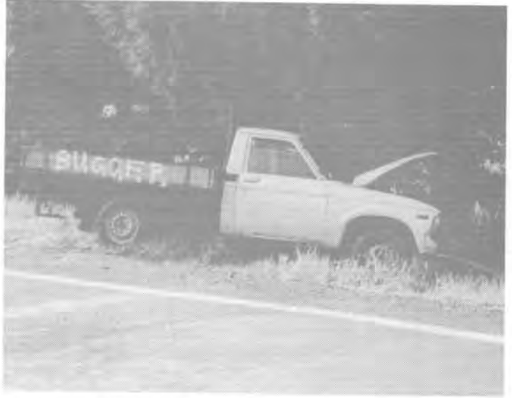
"Toyota comes to Waitakere City...Carter Road"